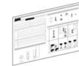
Installation Sheet x 1