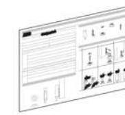
Installation Sheet x 1